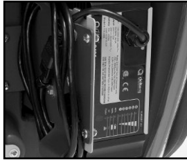
Standard onboard battery charger for wet or gel battery packages.