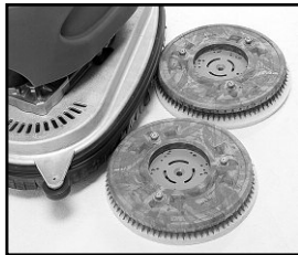
Click-off disc scrub heads for productivity and convenience.