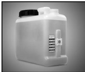
Available with AXP™ Onboard Detergent Dispensing System.

Patent-pending Soft-Touch™ Paddle System provides superior comfort and safety